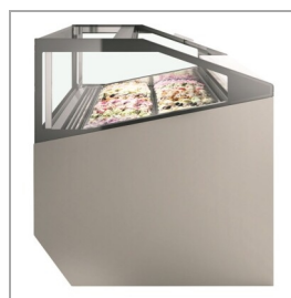
Glass end walls as standard